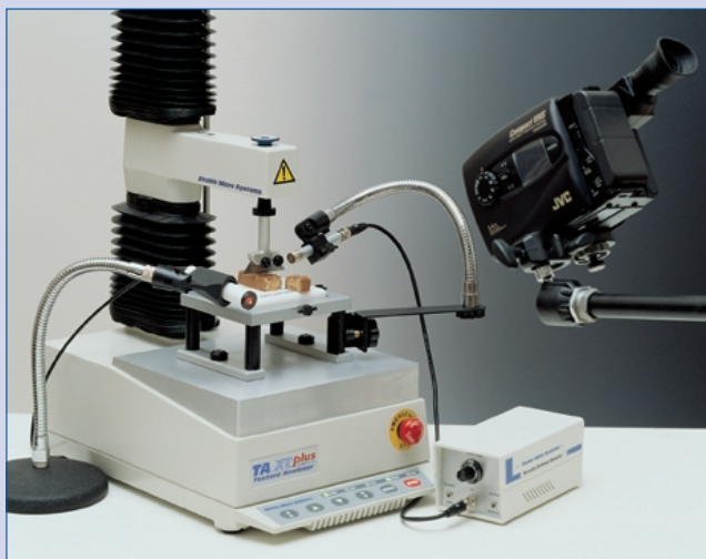
Figure 1. The Video Playback Indicator is set up in the frame view of the test sample on the TA.XT plus Texture Analyser,